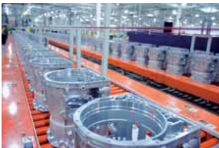
More productivity with lower TCO e.g. in a gear plant.

iQ's CPUs lead the industry in performance. Combined with an advanced backplane architecture to optimize system communications, these provide faster ROI due to reduced cycle times and increased productivity. iQ's PLC CPUs execute programs in microseconds while handling thousands of I/O. Advanced motion capabilities control dozens of axes simultaneously via the